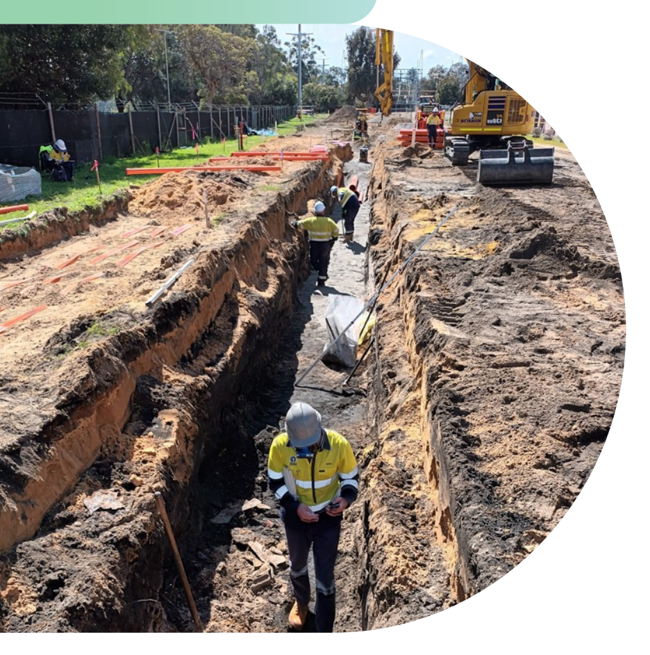
Installation of underground power services along the Swan River foreshore