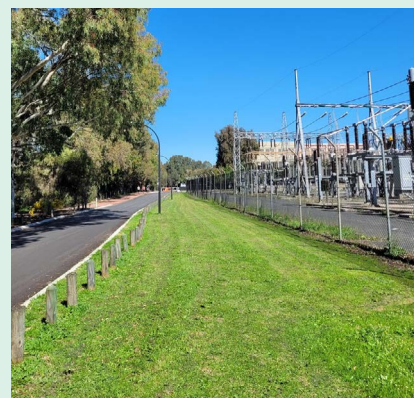
After power infrastructure removal