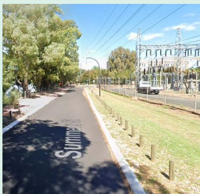
Before power infrastructure removal

Remediation works to prepare the site for revitalisation have progressed well and are nearing completion – bringing the redevelopment of the area one step closer.