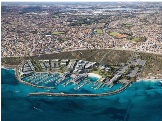
Artist impression showing the breakwaters (indicative only)

The new breakwaters will be approximately two kilometres long and up to 18.5 metres high from the ocean floor. Connected to the shoreline, these structures will extend offshore and provide calm waters within the marina development.