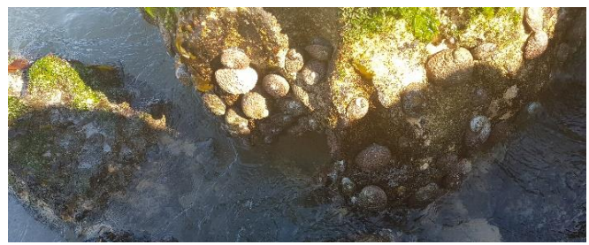
Abalone growing on the breakwaters

In the last few months, marine engineers have identified numerous abalone habitat growing on the inner and outer sections of the northern breakwater. The breakwater appears to have created an artificial reef for the abalone. The abalone spawning period commenced as of 1 June and concludes on 31 October.