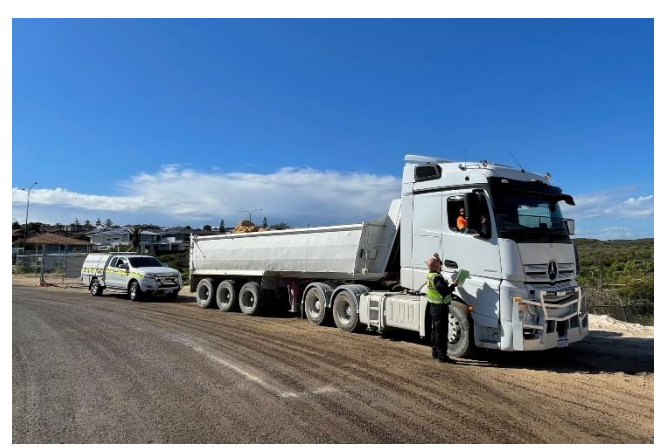
Transport Officer inspecting a truck at the northern site

All trucks travelling to and from the breakwater sites are using approved routes. Details of these approved routes are available on the project webpage. The Contractor holds 'Toolbox Sessions' with its workforce, and regularly reminds drivers about their safety obligations, including in school zones and not overtaking cyclists travelling along Ocean Reef Road. Main Roads Transport Officers regularly inspect trucks accessing the sites to ensure compliance.