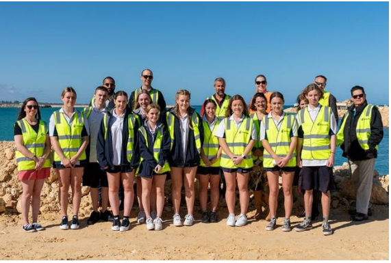
Students visit the new northern breakwater

On 8 September, the project team welcomed Year 11 students from Ocean Reef Senior High School to participate in a site excursion. The marine science students learnt about the project scope and activity on site being delivered by a team of technical specialists and professionals across a variety of fields including engineering, property development, project management, environmental approvals, and community relations. The students also toured the breakwater sites by bus. A special thanks to the staff and students for their interest in the project and participation.