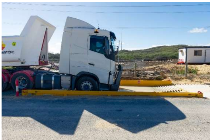
Truck exiting the southern breakwater site via a wheel washer

We will continue to work with the Contractor to identify the most appropriate, reasonable measures for both preventing and suppressing any potential dust from the site and to meet the expectations of our neighbours.