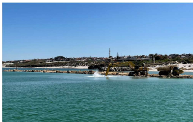
Removal of the existing breakwaters is underway

Changes to safety rules now include a monitored 20m 'Exclusion Zone' around the breakwater construction area, to maintain the safety of everyone undertaking recreational sea sports, from boating to fishing. Both wind and kite boarding activities are now also banned within the marina. For further information visit the Marine Safety WA Facebook page. Visitors and mariners should view the current Department of Primary Industries and Regional Development fishing notices and the Department of Transport's current advice to mariners to ensure public safety. For more information, visit http://www.fish.wa.gov.au/About-Us/News/Pages/default.aspx and https://www.transport.wa.gov.au/imate/perth-notice.asp